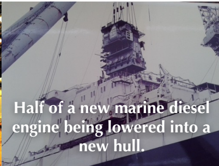
Half of a new marine diesel engine being lowered into a new hull.