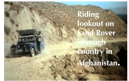
Riding lookout on Land Rover in rough country in Afghanistan.

During this time, three of us decided we needed more excitement and so managed to get six months unpaid leave. We purchased a Land Rover and drove from the UK out to and around India, and then home again. A fantastic and exciting trip of 25,000 miles, and travelling through countries that are now almost inaccessible. Later in my career I was posted to Japan for 5 years. My job was to witness, on behalf of my company, all the engineering work required in the building of new ships or conversions. This involved engine building and testing and then all installation of equipment in the new hulls. We were posted to many shipyards up and down the country, which was a fantastic way to learn to understand the Japanese way of life. After about 20 years my wanderlust started to fade and I settled down to married life here in Suffolk. I now have two children who are now both parents.